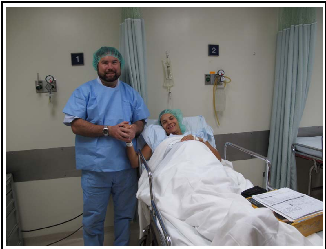
All geared up in hospital clothes. Dad is nervous but Mum is doing just fine.