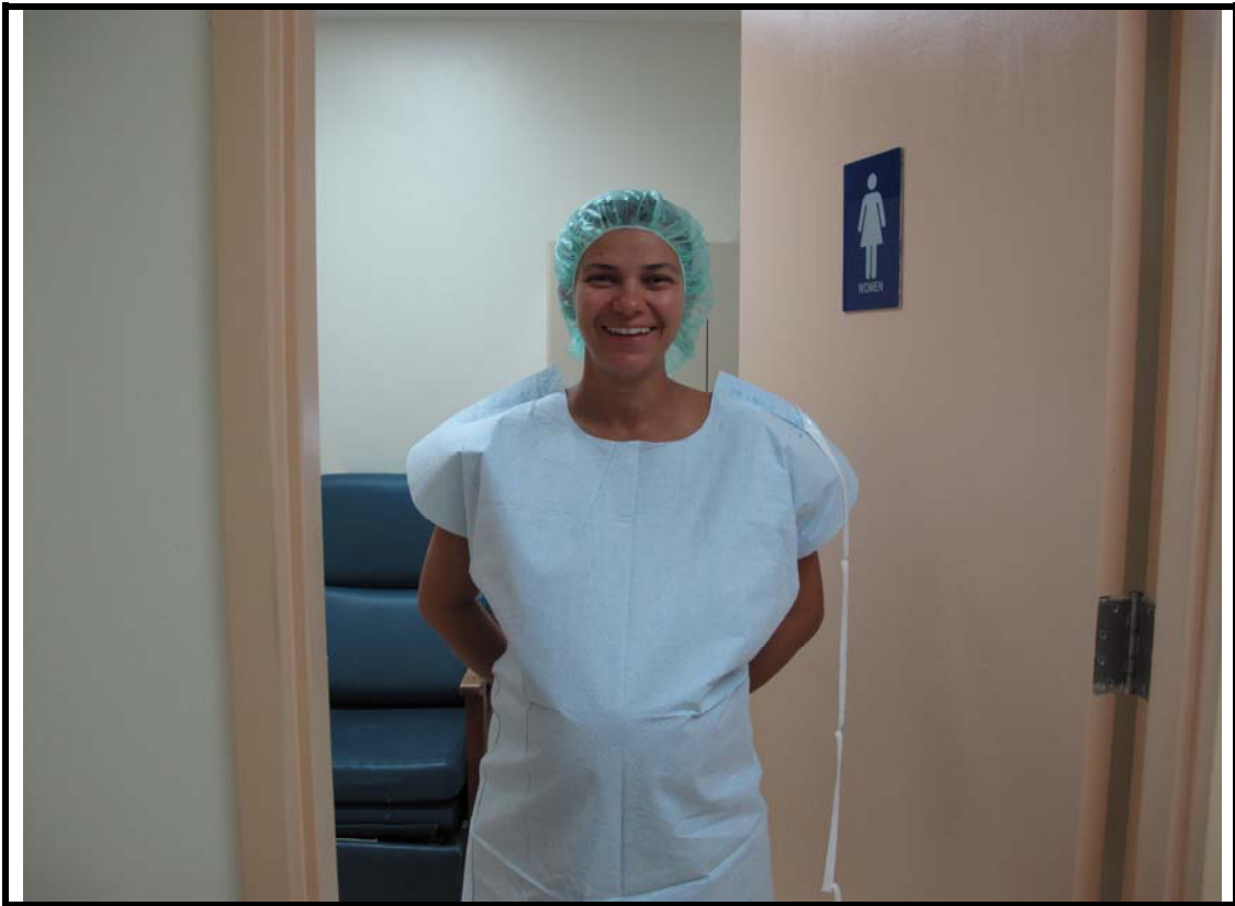
Mum getting ready